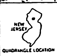
FIGURE #1 SITE LOCATION MAP MILLINGTON SITE MILLINGTON, N.J.